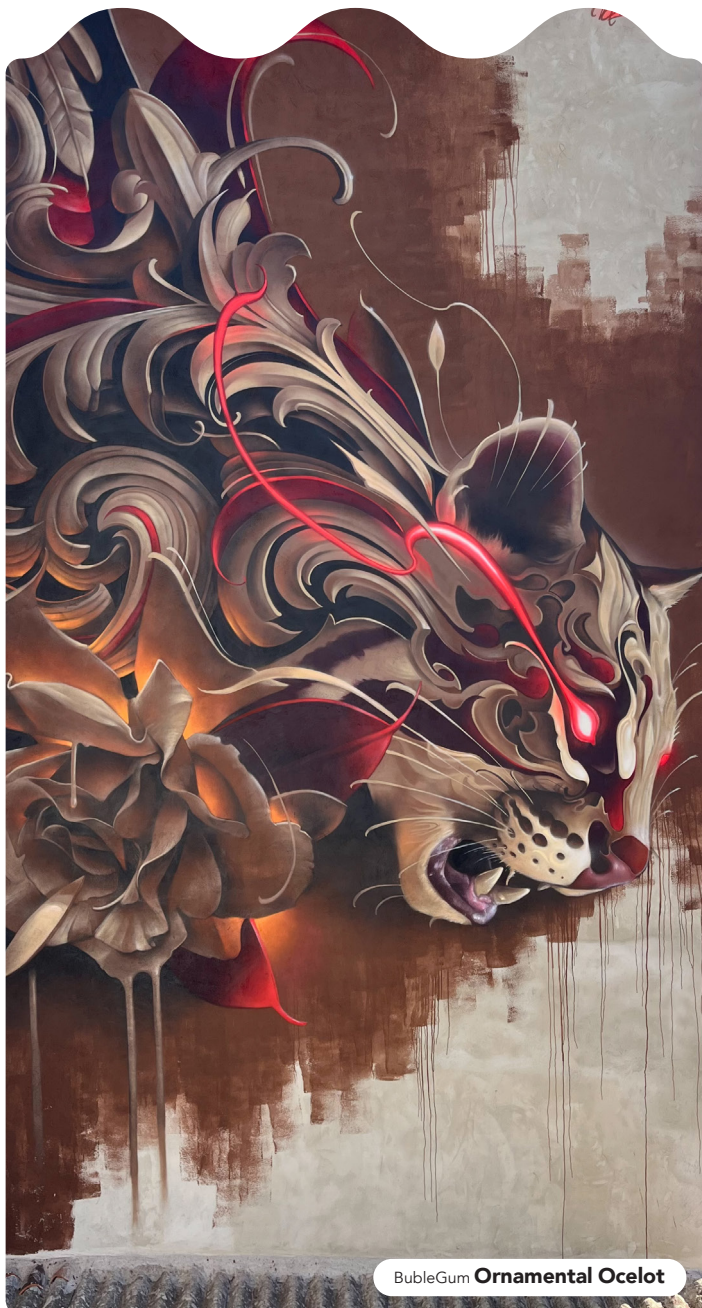
BubleGum Ornamental Ocelot

If you need help documenting the process during creation, let us know, we love to hop over with our team and our gear to help you not only create great content, but to preserve the making process for generations to come.